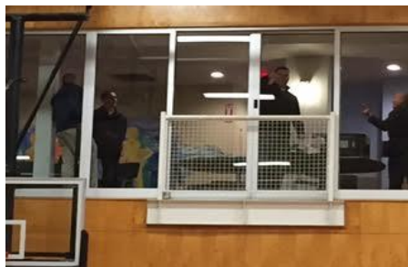
LONDONDERRY STAFF AT COAHCES APPRECIATION BUFFET