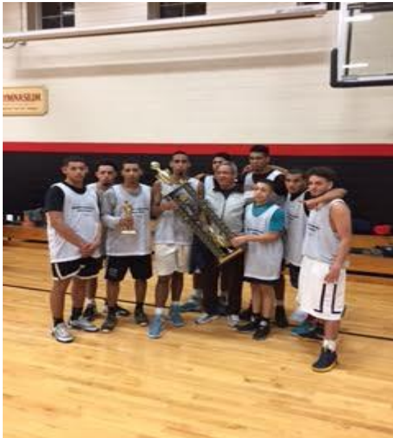
THE 2016 CHAMPS – LAWRENCE TJ MCEVOY MEMORIAL CHAMPIONS

The annual GOOD, BAD and UGLY is just a review from those running the league, input from coaches, volunteer coaches, refs, college coaches and Gym Rats that support and watch fall ball games. Take this information as food for thought and then you can file it in your mind or throw it in the dumpster. We hope you can roll with the information. Remember the information, performances, paper awards etc. are based on 11 weeks of Fall Ball only. Remember humor is a good thing. We have tried all fall to shed positives as well as constructive criticism on the teams and players that make up this league. We hope you enjoy the GOOD, BAD and UGLY . As my good friend Colonel Jessup once said "You need me on the wall"