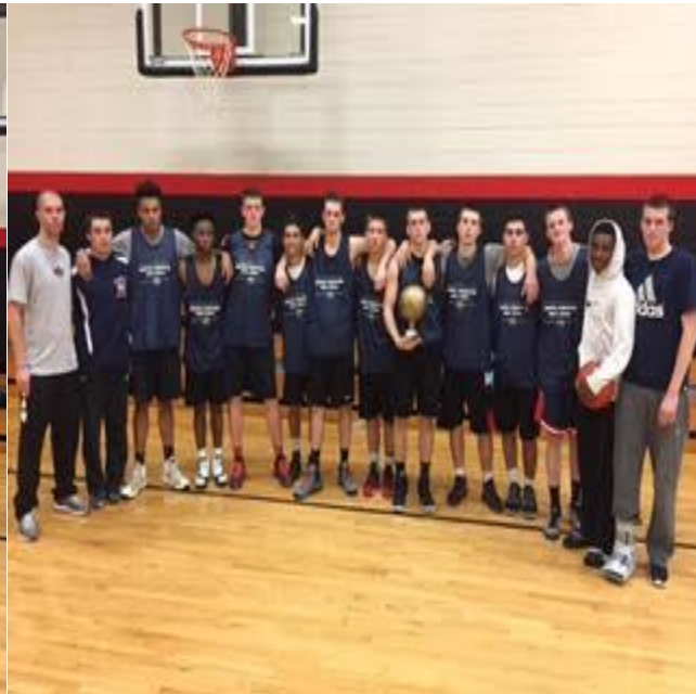
2016 RUNNER-UPS – NORTH ANOVER BILL MOECKEL MEMORIAL RUNNER-UPS