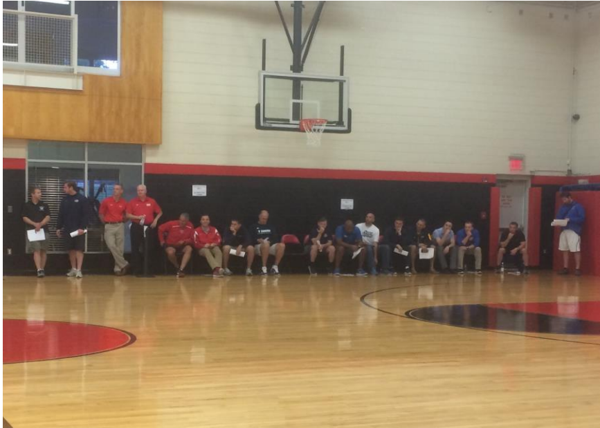
Just Another Night in the