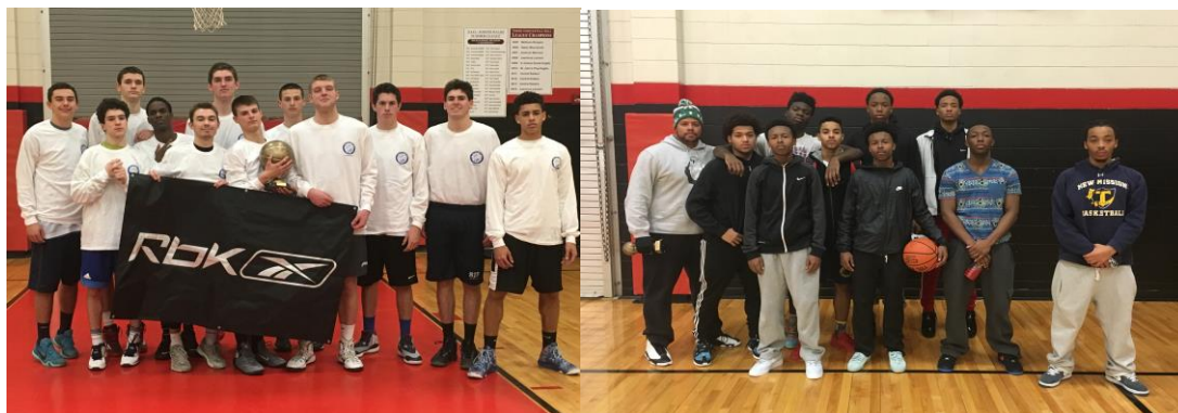
THE 2015 CHAMPS –SJP

The Annual GOOD, BAD and UGLY is just a review from those running the league, input from coaches, volunteer coaches, refs, college coaches and Gym rats that support and watch fall ball games. Take this information as food for thought and then you can file it in your mind or throw it in the dumpster. We hope you can roll with the information. Remember the information, performances, paper awards etc. are based on 11 weeks of Fall Ball ONLY. Remember humor is a good thing. We have tried all fall to shed positives as well as constructive criticism on the teams and the players that make up this league. We hope you enjoy the GOOD, BAD and UGLY. Remember as my good friend Colonel Jessup once said "You Need Me on the Wall"