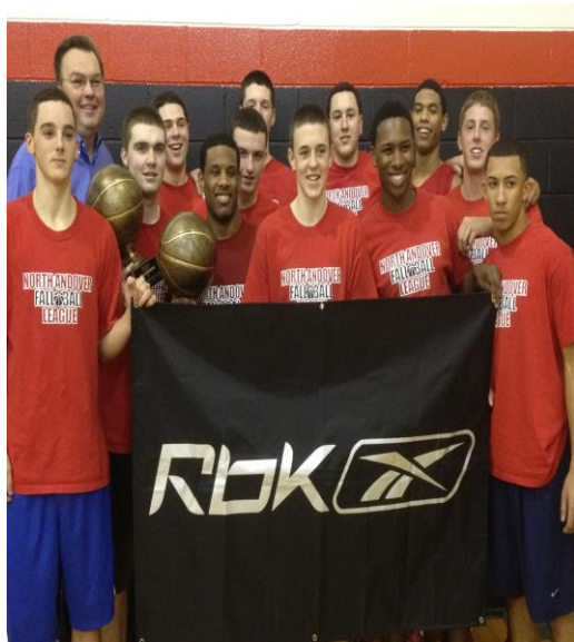
CC 2011 CHAMPS

THE ALL ENIGMA TEAM: Hands down this year it is the ANDOVER GOLDEN WARRIORS but for 8 weeks SJP EAGLES gave them a run for the money