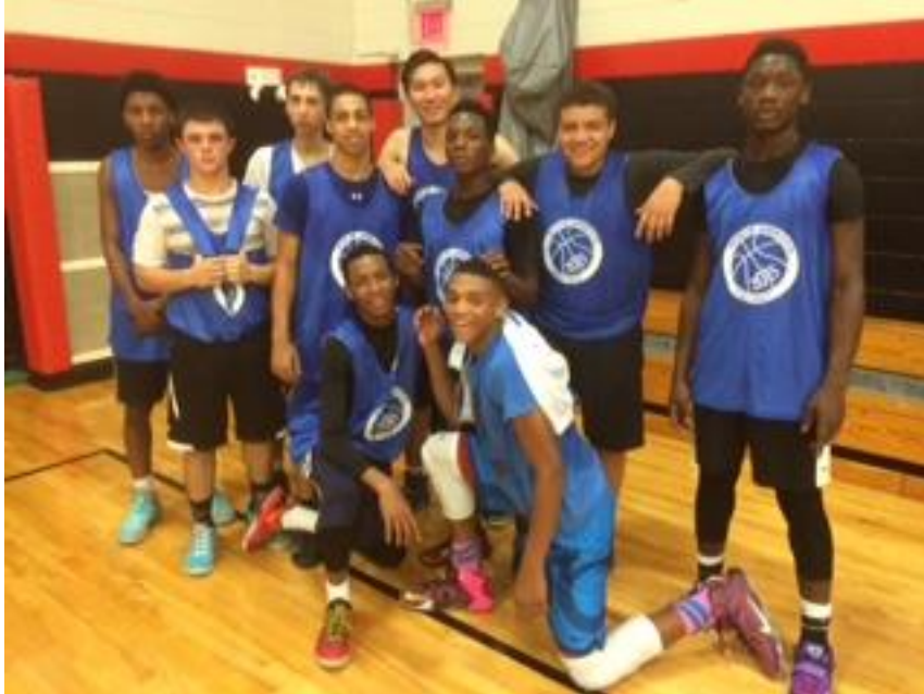
ST PETER- MARIAN

TEAM SPORTSMANSHIP AWARD: ST PETER- MARIAN – This young team from Central Mass exhibited the best sportsmanship from top to bottom. Kids were awesome, respectful and true competitors. Volunteer coach had complete control and win or lose the team presented very well